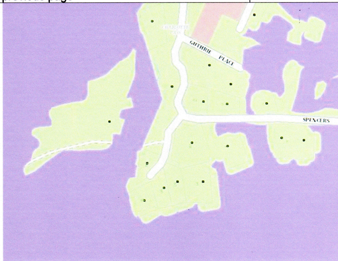
Charlotte Pass Village Areas of high biodiversity values (Boundaries mapped onto diagram on previous page)